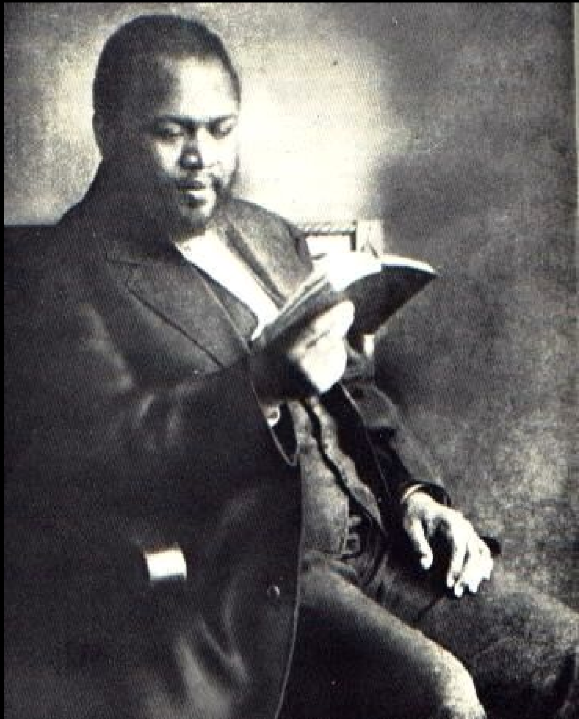
Pastor William “Daddy” Seymour